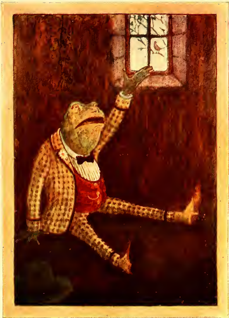
O UNHAPPY AND FORSAKEN TOAD